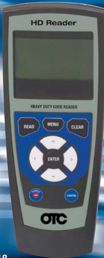
3418 HD Reader™